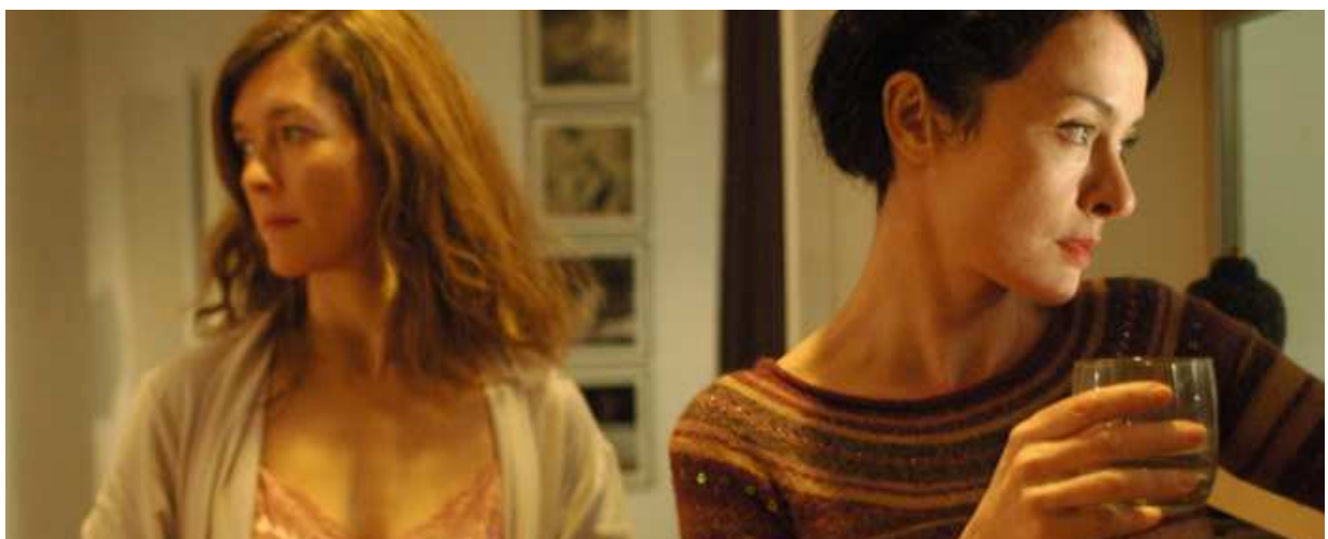
Elisabeth Fregoli and Rita