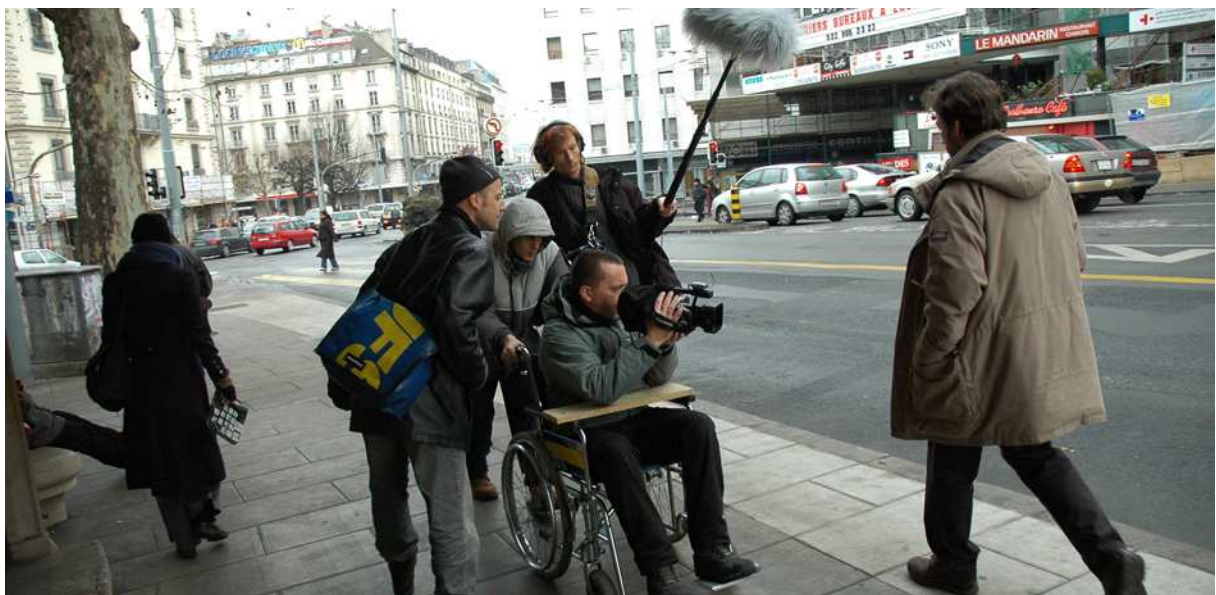
Shooting in Geneva