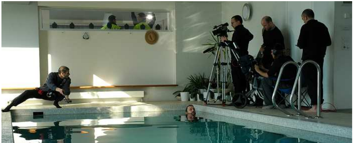
Villa Fregoli, Indoor Swimming Pool